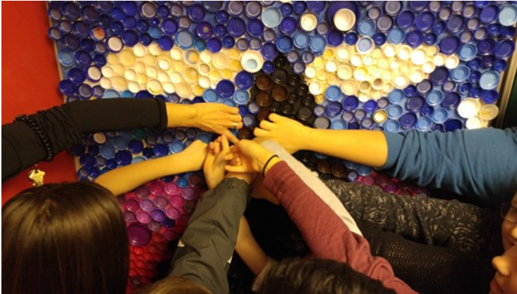
Plastic bottle cap art project by Project Change