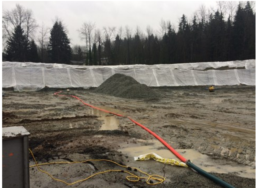
View from today... Excavators still busy this week